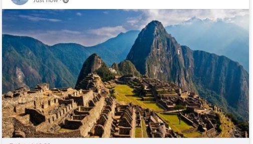
Find my Mum and Dad!