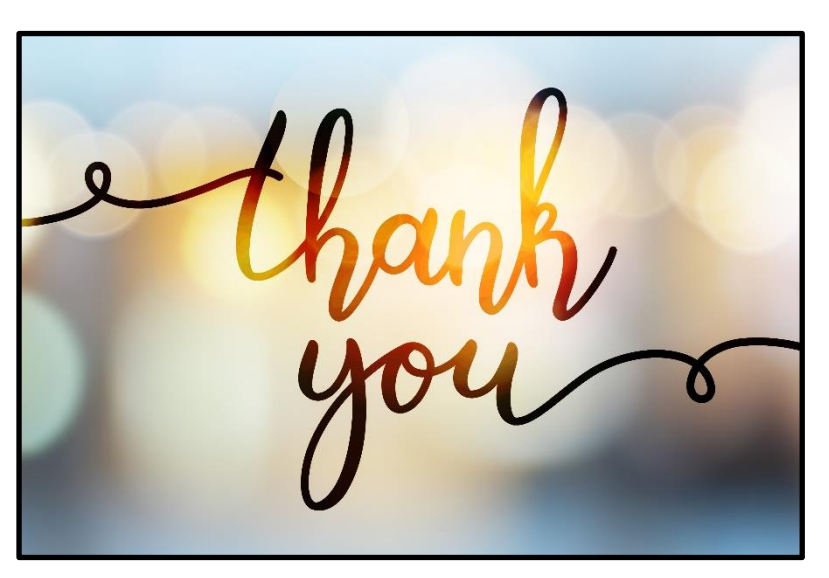
For your fantastic generosity during our Harvest Appeal!

We have heard from St Paul's Pantry to say that together we gathered enough food to make 472 meals for people in our community who need support. That is a phenomenal achievement and we are enormously grateful for your generosity.