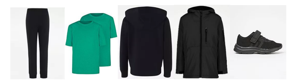
Sport Clubs are back!

Outdoor PE kit: Green t-shirt, black jogging bottoms, hoodie or zip up and trainers. Children may wear a plain black or navy blue waterproof jacket if they wish.