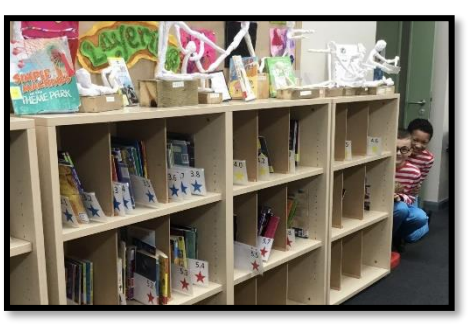
Can you find Wally and his twin?