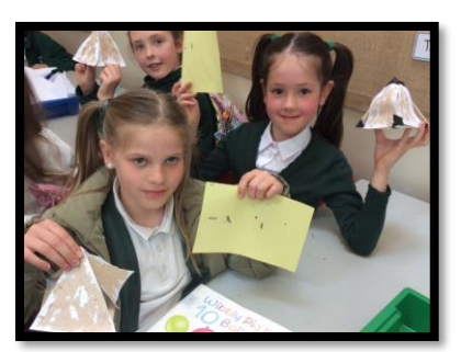
This week, in Science, we did a practical investigation to find out whether bigger magnets are stronger than smaller magnets.